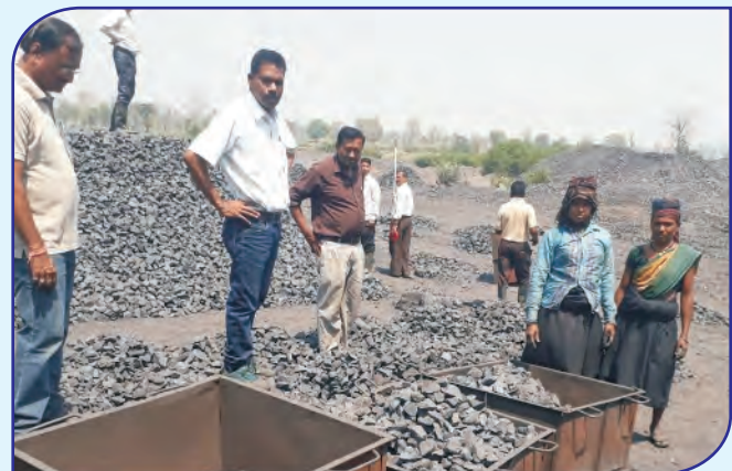
Ore stock verification, Balaghat Mine