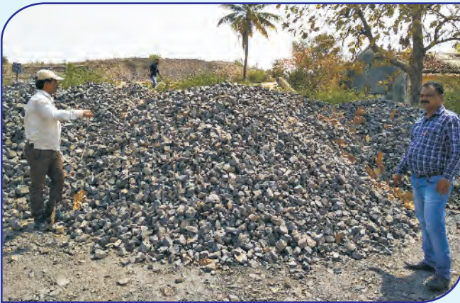
Ore stock verification, Kandri Mine