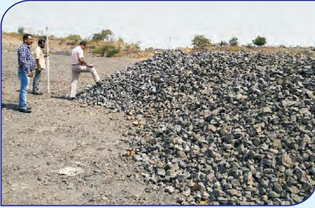
Ore stock verification, Munsar Mine