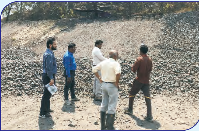
Ore stock verification, Gumgaon Mine