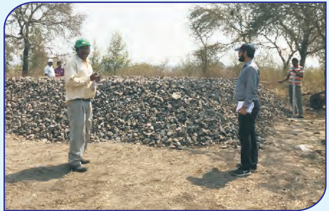
Ore stock verification, Beldongri Mine